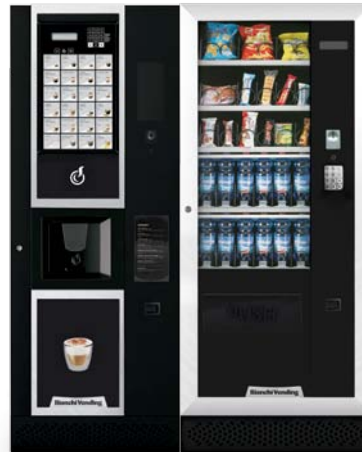
LEI400 EASY + ARIA M MASTER

LEI400, automatic vending machine for hot drinks with 400 cups capacity. Designed to easily interchange the push-button panel and adapt to different locations.